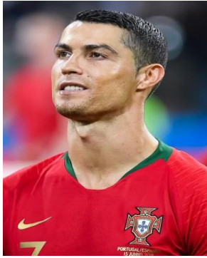
c) Cristiano Ronaldo