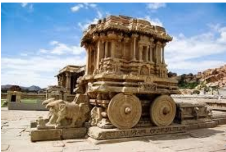
g) Group of monuments, Hampi