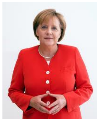
h) Angela Merkel