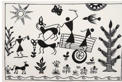
f) Warli painting