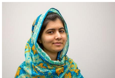
b) Malala Yousafzai