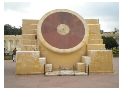
i) Jantar Mantar, Jaipur